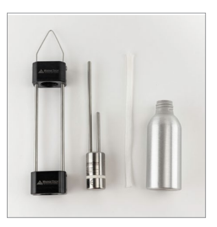
1. Remove all components from the packaging.