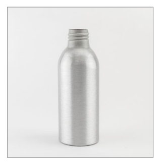
2. Fill the reservoir bottle with distilled water, approximately 2 oz (60 ml).