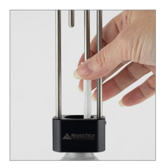
8. Adjust the sock on the probe so that it touches the bottom of the water reservoir.