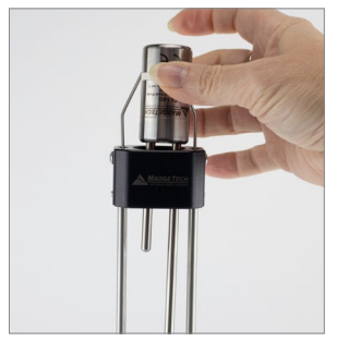
5. Insert the LCS140 data logger into the hanging fixture so it is suspended upside down.