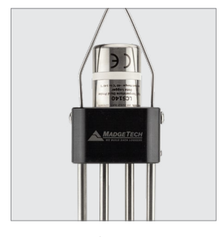
7. Ensure the LCS140 data logger is firmly secured in the fixture.