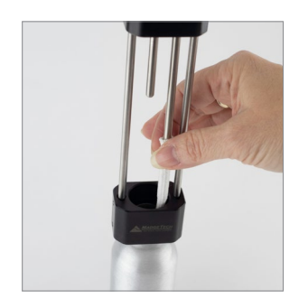
6. Slide the sock onto the 5-inch probe.