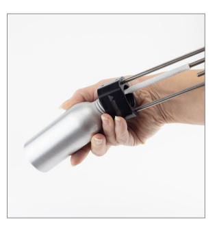
3. Screw the reservoir bottle into the bottom of the hanging fixture.