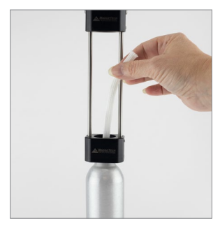
4. Drop the sock into the water about 2 inches.